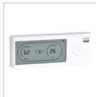
Radio remote control