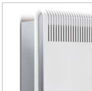
Side section without LED lighting function