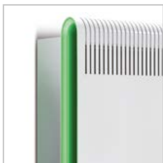
Side section with LED lighting function