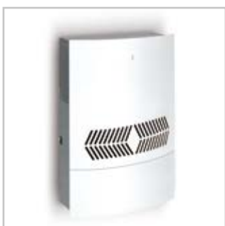
REMKO SLE 20 With condensate container