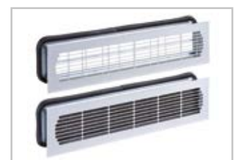
Next-room set 2 SLN