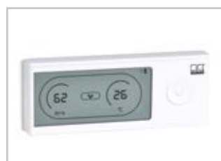
Radio remote control