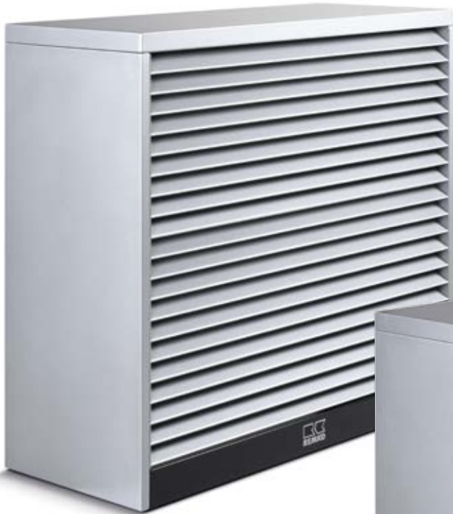
WDH 120 series Version: aluminium

The design highlight for your outdoor unit