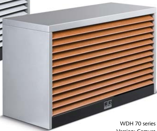
WDH 70 series Version: Camura