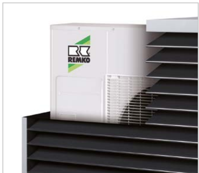
Cross-section of the design hood with a view of the outdoor unit