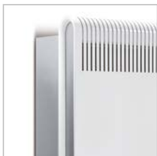
Side section without LED lighting function