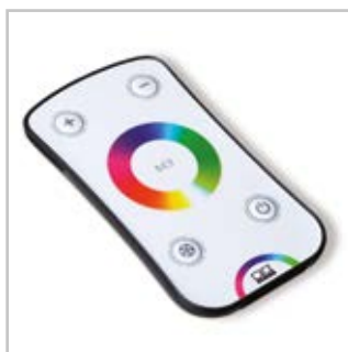
LED RGB remote control