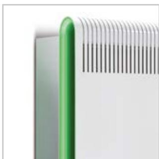
Side section with LED lighting function