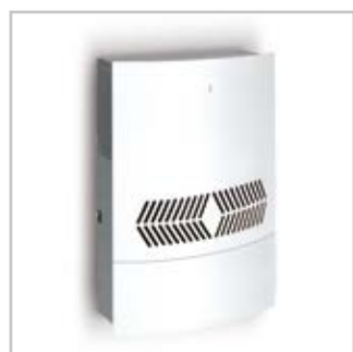
REMKO SLE 20 With condensate container